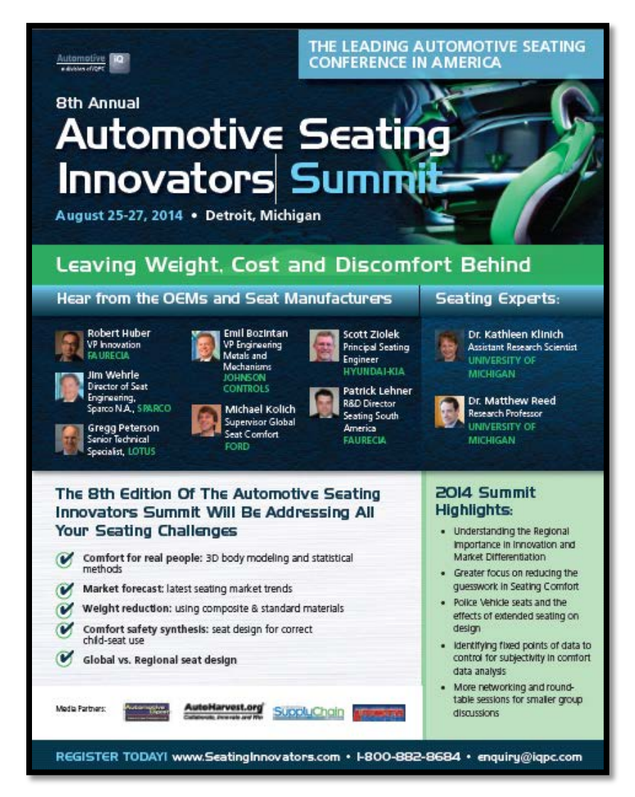
Download the Brochure

Email enquiry@iqpc.com or call 1-800-882-8674 for more information.